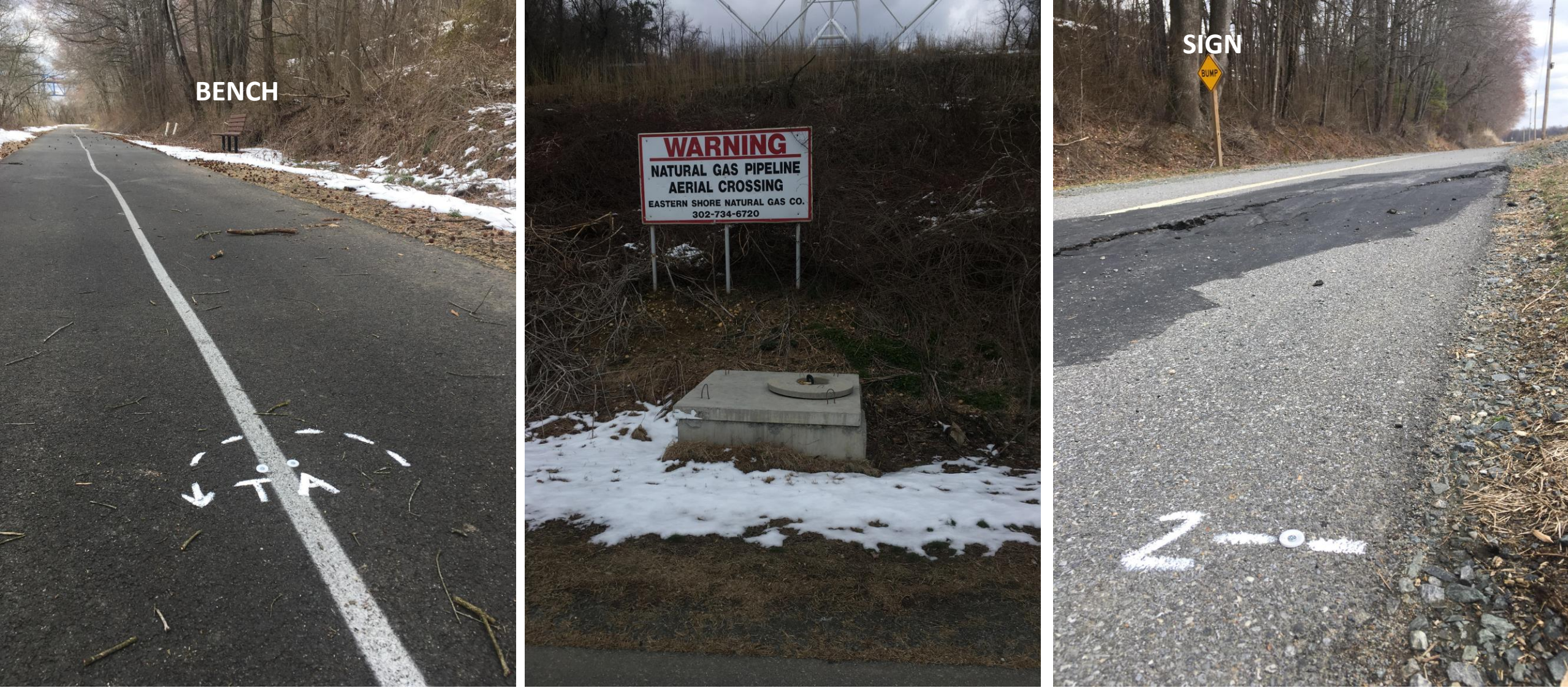
Turnaround is 55ft East of bench