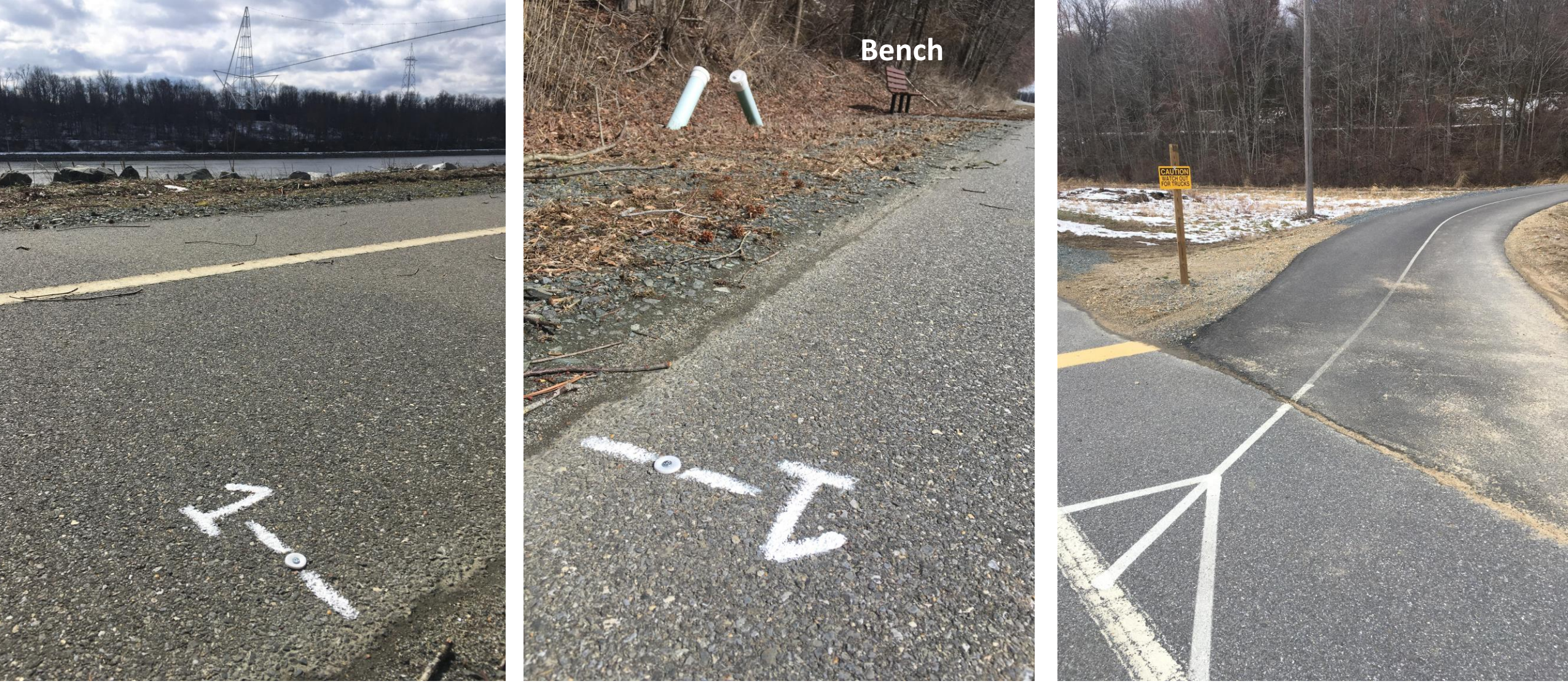
Mile 1 Facing Canal